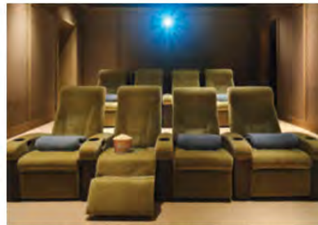
The screening room inside 43 East Dune Lane in East Hampton.

Designed in 1910 as part of the Wiborg Estate — and completely rebuilt as new in 2016 by builder Ben Krupinski — this storied property at 43 East Dune Lane spans 3.6 acres with 225 feet of private oceanfront. An allée of specimen beech trees leads to the 11,000-square-foot resi-