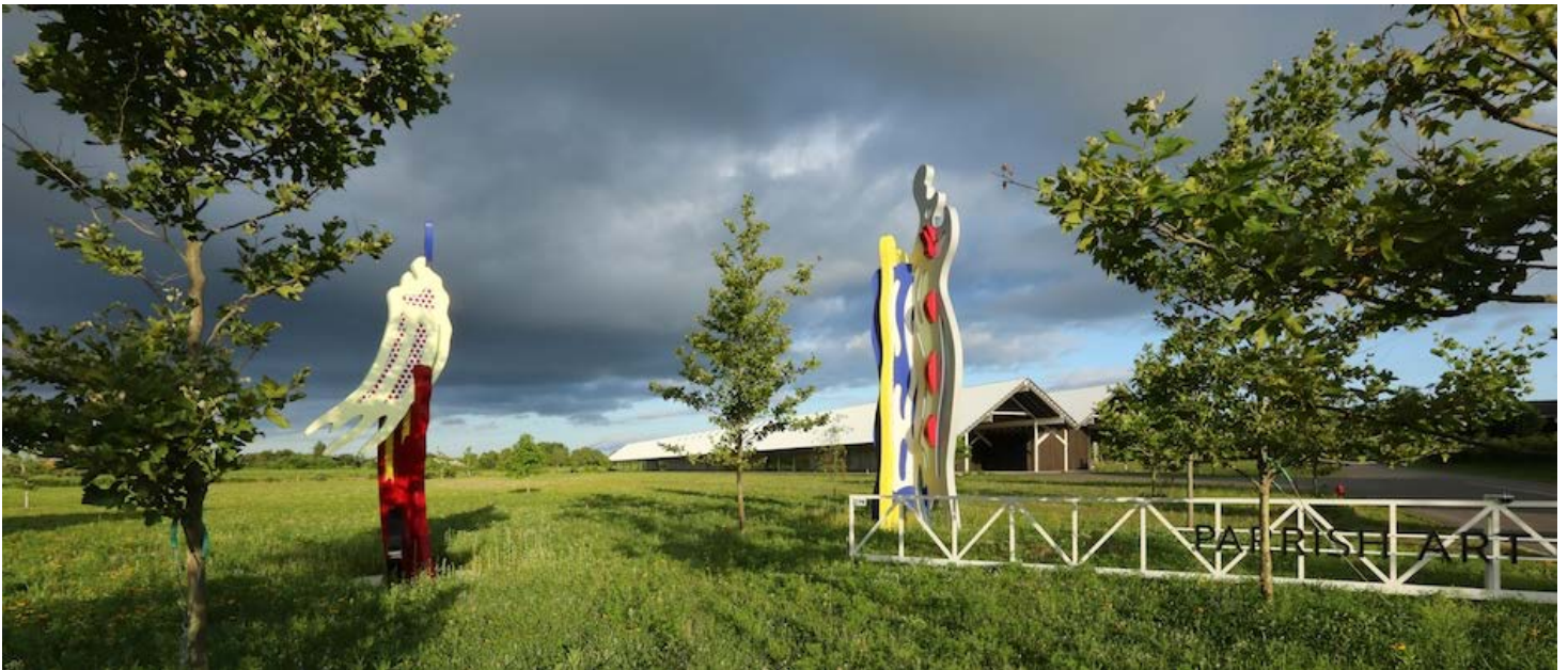
Roy Lichtenstein's Tokyo Brushstrokes I & II, August, 2014 ~~~~~